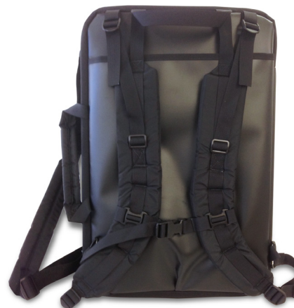
Tuck-Away back pack straps for hands free carrying.

Clear vinyl adjustable pockets in the base of the pack with clear vinyl tabs for easy marking and identification of all equipment.